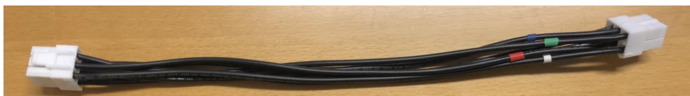
Table 1 Power connector, J2

Connector type equivalent: JST: B06P-VL.